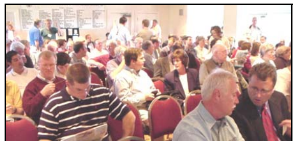
MASBO'S 2003 Annual Institute Conference Attendees